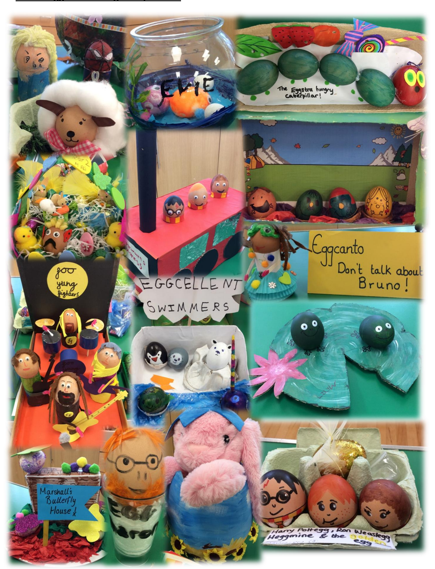
Page | 6