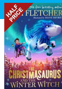
Christmasaurus and the Winter Witch By Tom Fletcher