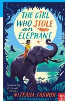
The Girl Who Stole an Elephant By Nizvana Farook