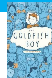
The Goldfish Boy by Lisa Thompson