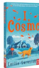
I, Cosmo By Carlie Sorosiak